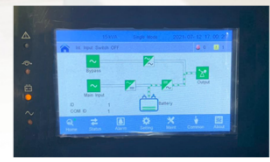
LCD Touch Screen

The Crystal Series Double Conversion true online Series, featured with DSP-controlled technology, superior input Voltage window for energy ECO mode, parallel capability (for 10KVA, 20KVA 3/1), smart fan speed control, optional powerful charger, is an ideal solution to your computer center, network center, communication system, automatic control system or other critical system.